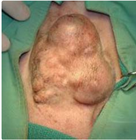
Figure 1. A dog with a mammary tumor just before surgery. The tumor is large and firm.

A palpable mass underneath the skin of the abdomen is the most common findings in dogs and cats with mammary tumors (Figure 1). However, other signs and symptoms include discharge from a mammary gland, ulceration of the skin over a gland, painful, swollen breasts (Figure 2), inappetence, weight loss, and generalized weakness.