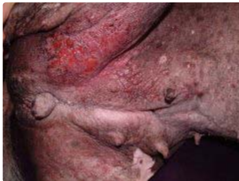
Figure 2. A dog with mammary carcinoma. The overlying skin is ulcerated and painful. As a result, this dog is lethargic and unwilling to eat.